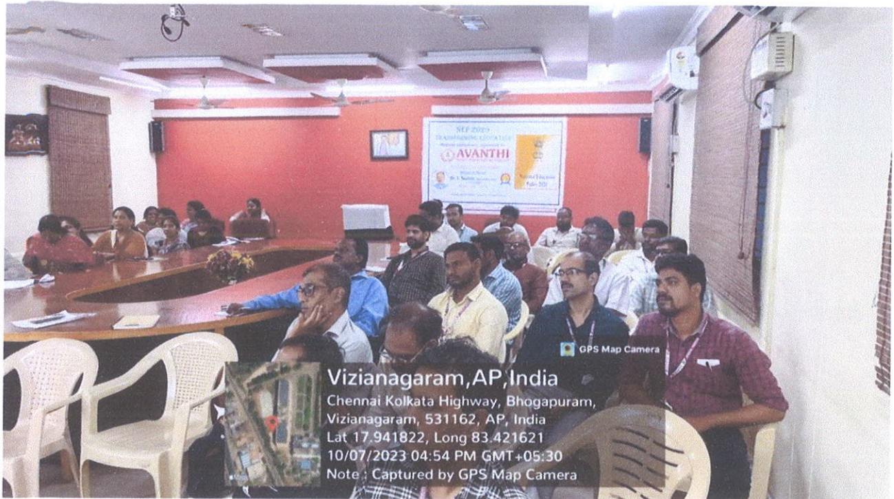
The faculty members listening to the lecture with rapt attention

www.aietta.ac.in, principal@aietta.ac.in