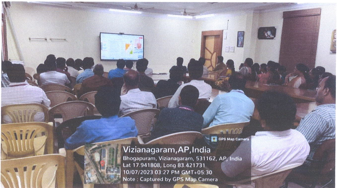
The speaker explaining various points of NEP 2020 through presentation